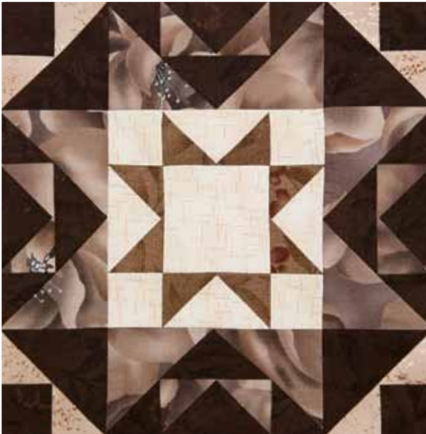
Pattern from Quilters Newsletter Best Patchwork Blocks 2005

The star within a star in this pattern is intriguing. Value placement is very important in order for the parts to be well defined. Follow the piecing diagram shown to construct the Eight Hands Around block.